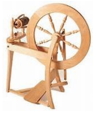
FOR SALE: see next page. This is not the actual wheel. Same model.